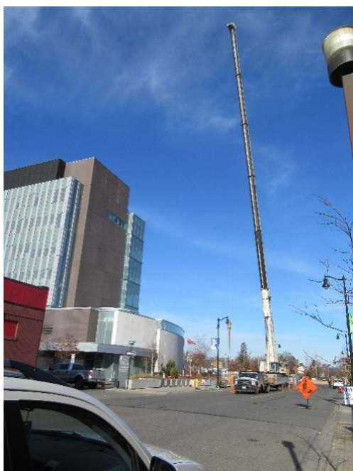
Crane moving materials in/out of the courthouse

After an afternoon of rearranging my rec room to accommodate my temporary office, I was back in business with access to almost everything I needed, except the library print collection and most of my files. Since October 4th, it was not possible for Iris to do any work. Most of our new books, which had arrived the week before the fire, were still at the library - as well as all of her processing supplies. My next challenge was advocating for another visit to the library with Iris to retrieve books, supplies, circulation records, etc.